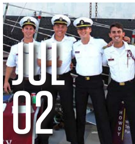
TS GOLDEN BEAR PORT CALL: GALVESTON