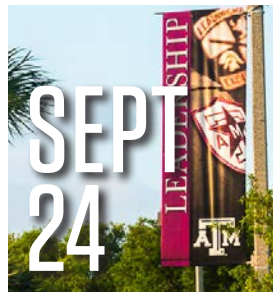
BOARD OF VISITORS