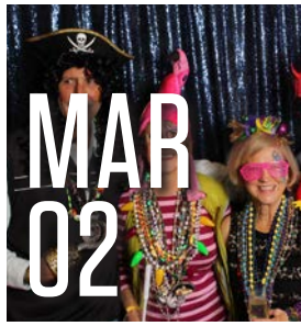
A&M MARDI GRAS PARTY