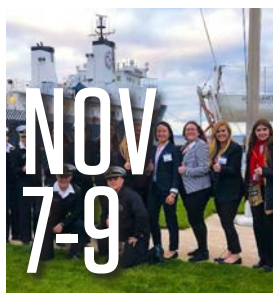
WOMEN ON THE WATER CONFERENCE