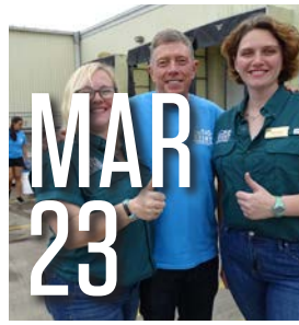
THE BIG EVENT