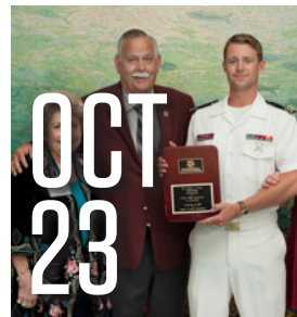
ENDOWED SCHOLARSHIP RECEPTION