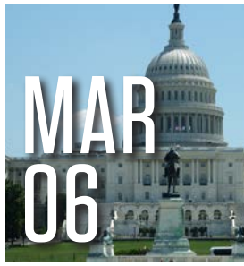
GALVESTON DAY IN THE CAPITOL