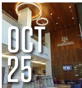
GEDP ECONOMIC SUMMIT AT TAMUG