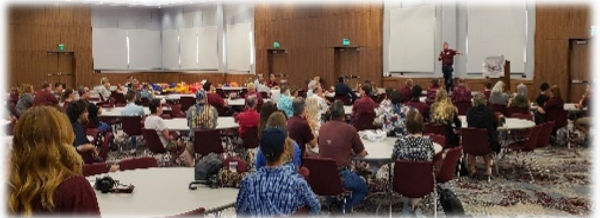
September 22, 2018 Welcome Back All Class Reunion Sea Aggie Former Student Network (SAFSN)