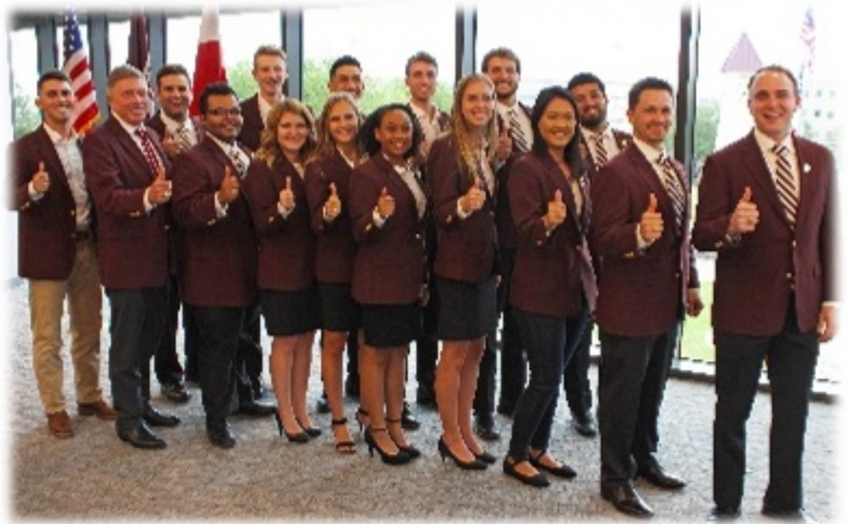
September 21, 2018 Coating Ceremony for the 2018/2019 Class of Maroon Delegates. Congratulations!